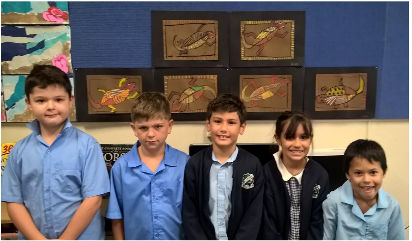
Students in 3/4M did wonderful, creative work linking visual arts to Geography! Fabulous!