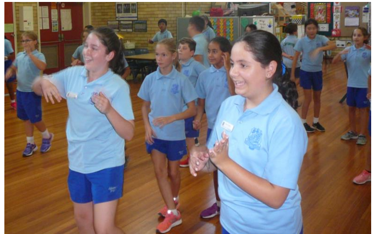
Our Stage 3 students in 5/6B had a lot of fun on Tuesday as part of their Fitness sessions linked to the Personal Development/Health/Physical Education syllabus and curriculum requirements.