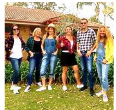
Everyone got behind the fund raiser hosted by the SRC to help the farmers. We raised $ 255.00 - Very well done!