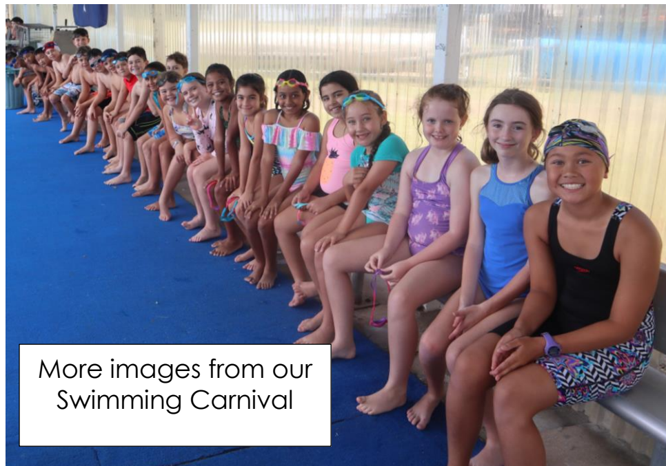
More images from our Swimming Carnival