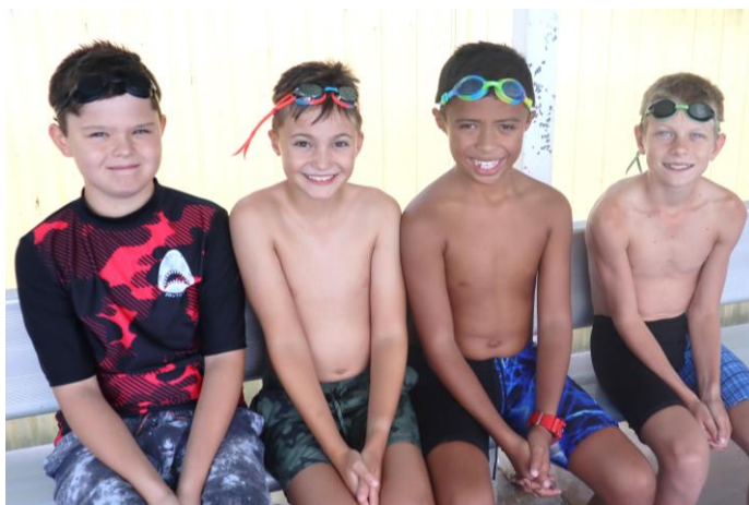
Happy faces at our annual Swimming Carnival