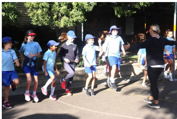
Getting fit with “High knees” at Netball trials/training before school