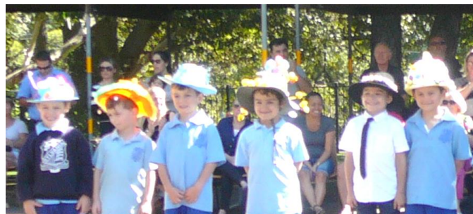
Get Creative! Some of the students with the hats they made at home for the Easter/Holiday 2017 Parade