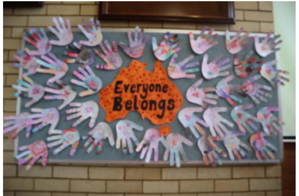
Images from Harmony Day Activities and Assembly - Everyone Belongs!