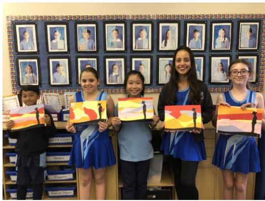
Wonderful artworks from 4/5X linked to ANZAC Day!