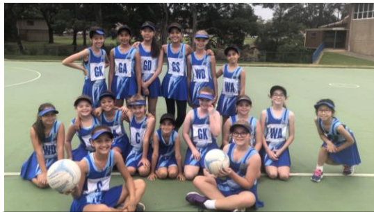
Our netballers were ready to go and had fun ..... unfortunately the game was called due to the rain!