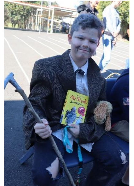
More images from Education Week and the Book Character Parade!