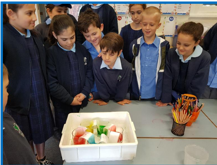
Challenge Club students with their walking water experiment.

We need canteen volunteers so please contact the office if you or your child's aunts, uncles, or grandparents have any spare time! We would love to see you ~ we know the kids would too!