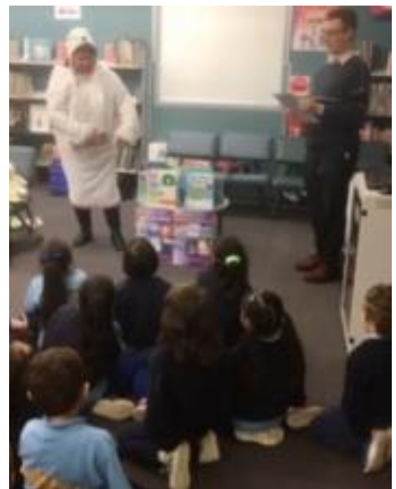
Photos from the Librarian visit for K - 2